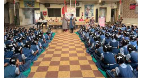
Good touch – Bad touch awareness program for 275 students at Unioun School