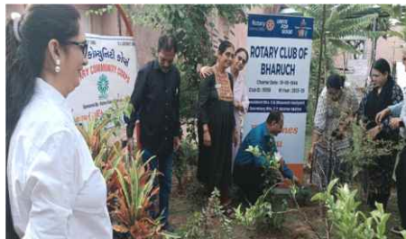
Tree Plantation at Shishu Gruh Bharuch (RCC & Rotary Club Jointly)