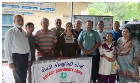
Food distribution at Seva Yagn Samiti