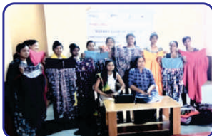
Women Empowerment Project