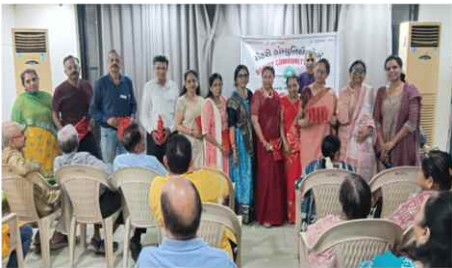
Aarati Competition for RCC members