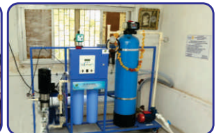
Clean Drinking Water