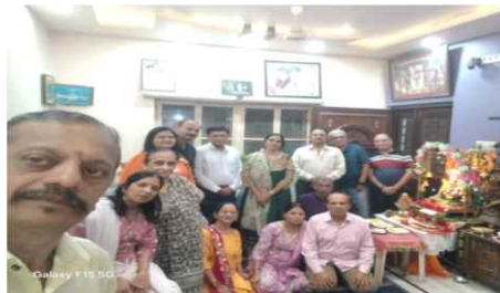
Ganesh Aarti at RCC'S Board Members Residence