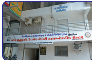
P.D. Shroff Rotary Diagnostic Center