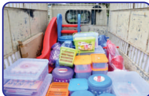
Mobile Toy Library - Ramakdu