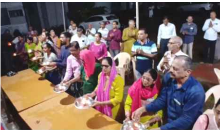
Participated in Sandhya Aarati at Shiv Mahotsav Tapovan Sankul