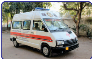
Ambulance & Morgue Vehicle