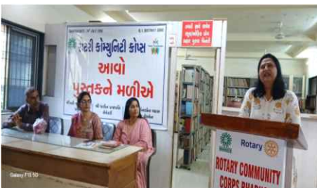
“Avo pustak ne maliye” at RCC pustak ghar Bharuch.