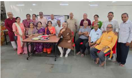
Raksha bandhan Celebration at Ghardaghar, Bharuch