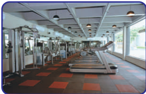
M. I. Patel Rotary Youth Center