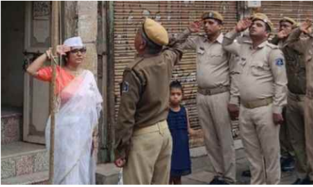
Independence Day celebration at Juna Bajar Pustakalay Bharuch