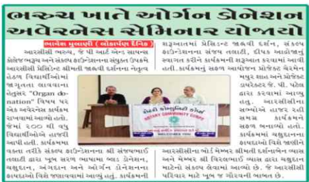
Seminar on Organ Donation for students of J. P. Arts and Science Collage Bharuch