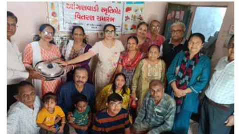
Aanganvadi smruti Chinh mahotsav at Aktanagar Aanganvadi