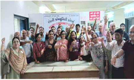
Celebration of friendship day at Pustakghar, Zadeshwar