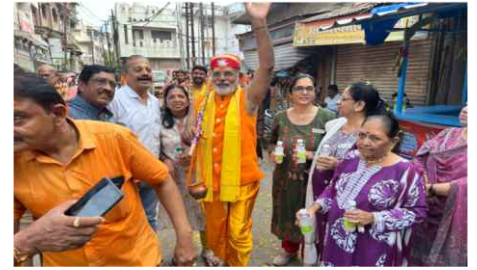
Farali Food Vitran to Kavdia Yatri at Chakala, Bharuch