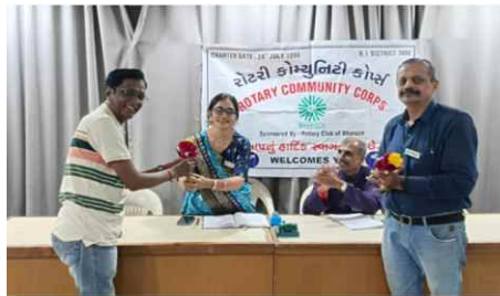
Celebrated World Photography Day and honoured RCC Photographers