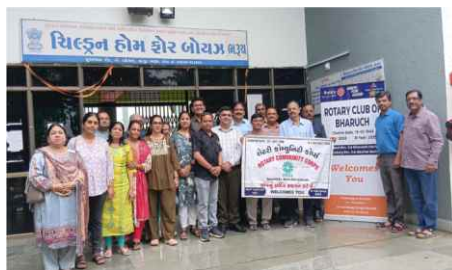
Aarti competition and Prize Distributed at Shravan vidhya Dham