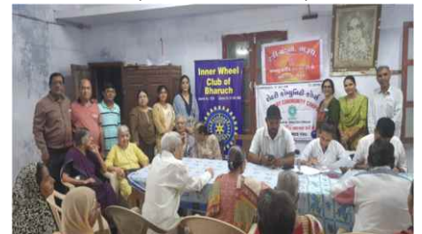
Ayushman vay vandana card camp with Innerwheel Club and Streemandal at Chunarwad