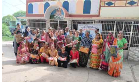
Sari – Pent distribution at tadiya area in Bharuch