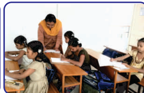
Hum Honge Kamyab - Literacy